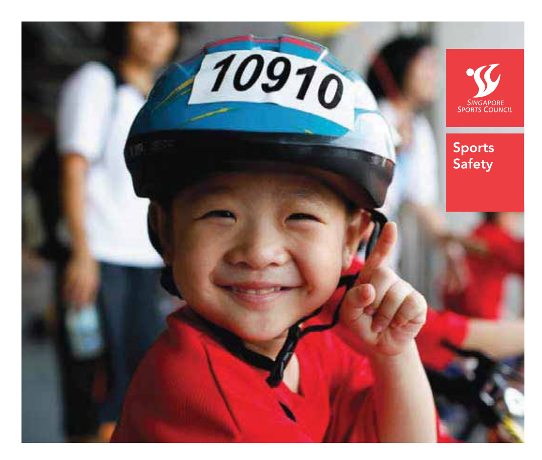
Safety Guidelines Ear children and young people

For children and young people in sports and recreation.