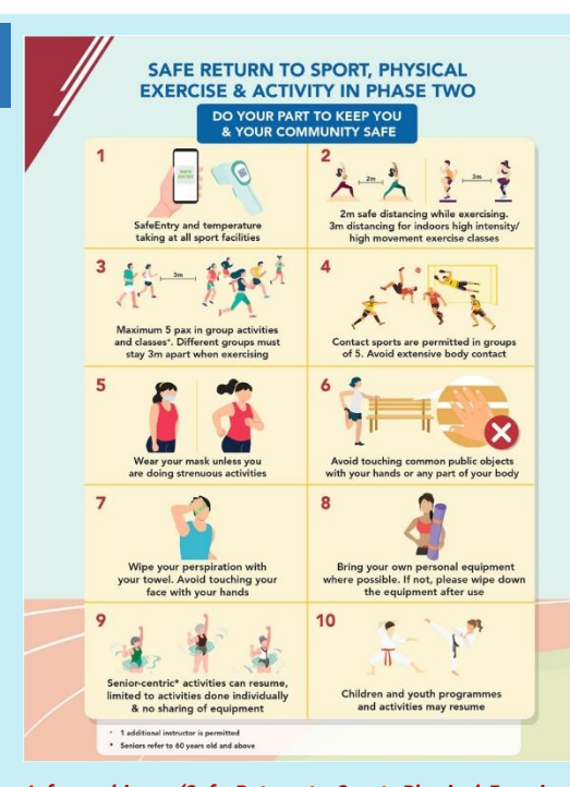
Infographic on 'Safe Return to Sport, Physical Exercise & Activity for Phase 2'.

For any queries, members of the public can email the Sport Singapore QSM at <u>SPORT QSM@sport.gov.sg</u> or call 1800-344-1177 during office hours (Mondays to Fridays, 9.00am to 6.00pm).