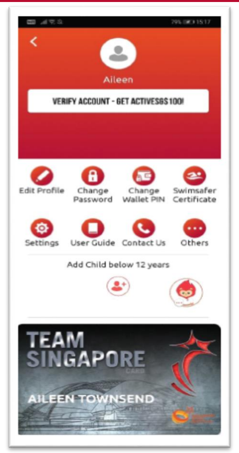
TeamSG rewards eCard on the ActiveSG app

Click <u>here</u> for the full list of participating merchants, their offerings and terms and conditions.