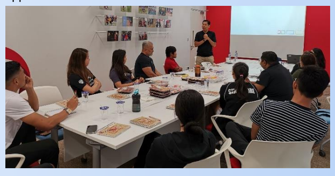
This course is part of Project Empower, which aims to equip athletes with skillsets and knowledge to further develop and bring out their best selves. Equipped with their personalized